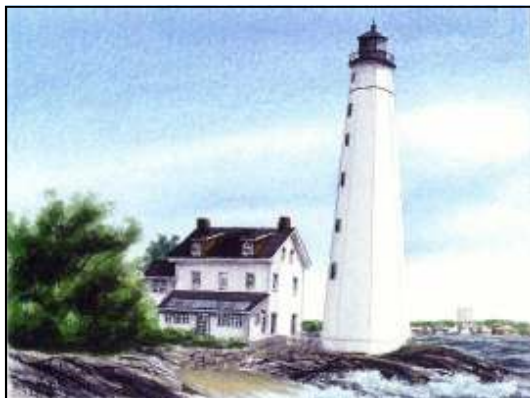
New London Harbor Lighthouse