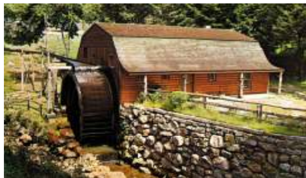
Winthrop (Olde Town) Mill